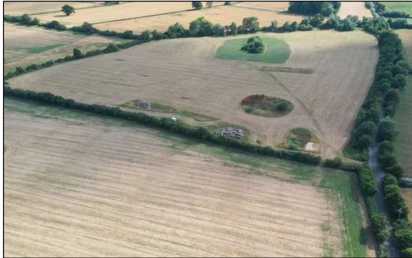
Multi-Plot Field Looking South

The field lies in the Parish of Tetsworth to the south of the M40 and adjacent to the eastern side of the Stoke Talmage Road. It has been subdivided into 122 individual plots which have been offered for sale through a number of agents. The field is variously described by agents as 'pasture land' and 'designated agricultural or woodland'. The Oxfordshire Way rural footpath (PROW) crosses the field en-route between the villages of Tetsworth and Adwell.