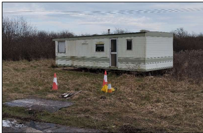
Residential Caravan near Access Gate

Approximately 3 or more years ago, a residential caravan was located on a plot adjacent to the field access gate. The caravan was placed on a gravel-covered membrane, but the remainder of the plot has remained uncultivated. Summer holiday occupation by the owner was anticipated but had not been noticed until a black car was seen parked alongside the caravan on 17 August 2025. The car was not there on 20 August, but the ground below the parking spot suggested that it had been present for a considerable period of time. Whether the car was associated with the caravan owner or an unidentified third party remains unknown.