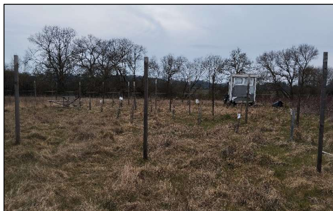
Campervan Plot and Orchard

At about the same time, a derelict campervan arrived on a plot straddling the Oxfordshire Way in the south-east of the field. Land to the north of the footpath was fenced and a small fruit orchard planted. Lines of leylandii evergreens were planned round the plot to the south of the footpath. The orchard may be permitted horticultural use of the land.