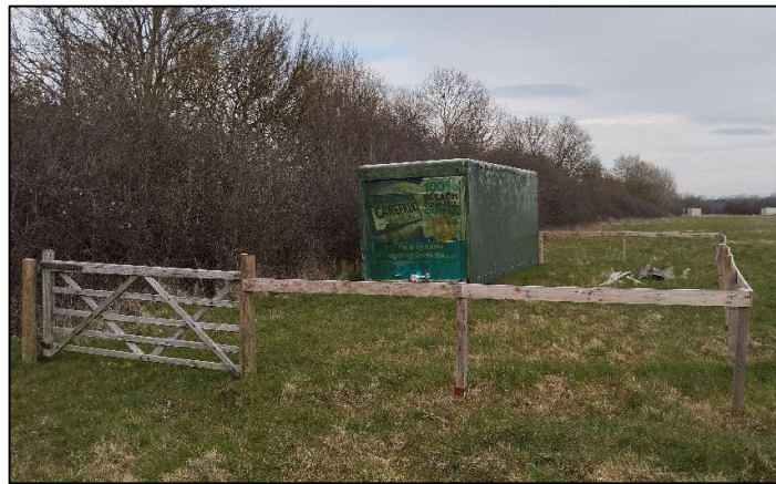
Container in Small Fenced Compound

Earlier in 2025, a sea container in a small fenced compound appeared on a plot adjacent to the Stoke Talmage Road. A commercial vehicle has been seen parked inside the compound. There has been no sign of agricultural activity.