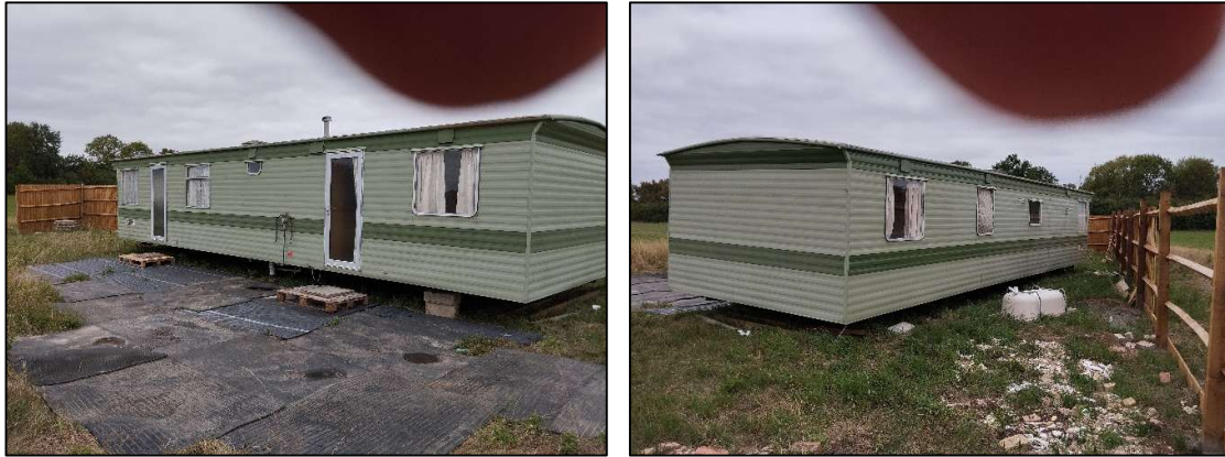
Fenced Caravan Plot as Developed and Vandalised, 20 August 2025