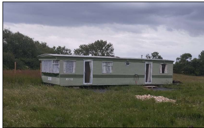
Large Residential Caravan soon after Arrival

Also earlier this year a large residential caravan appeared on a plot close to the centre of the field. The owner has said that it was intended to be occupied for weekend breaks and has subsequently erected fencing round the plot including close-boarded sections. There is currently no sign of intended agricultural use of the plot.